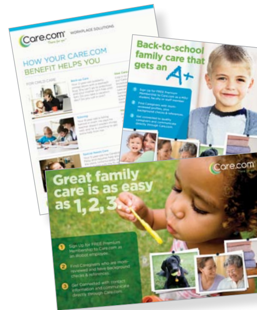
Sample marketing materials

No matter how you think of us— A WORK-LIFE, PRODUCTIVITY, LOYALTY, TALENT MANAGEMENT OR FLEXIBILITY BENEFIT —our cost-effective services address it all so your employees remain focused and working at the speed of your business.